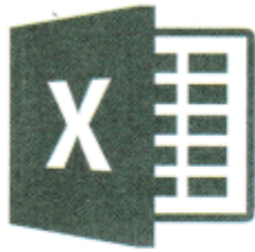
a. Excel 2013

spreadsheet software are Excel, Lotus 1-2-3 and OpenOffice.org Calc.