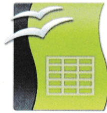
b. OpenOffice.org Calc