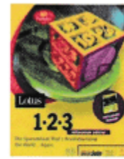
c. Lotus 1-2-3