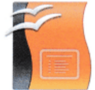
c. OpenOffice.org Impress