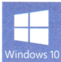
a. Microsoft Windows