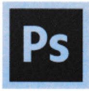
a. Adobe Photoshop