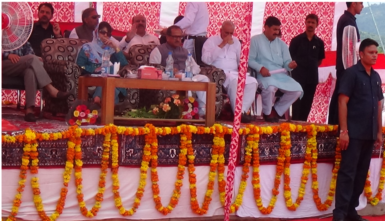
Hon'ble Chief Minister of J&K state, Ms.Mehbooba Mufti along with Dy. Chief Minister, Dr.Nirmal Singh during Inaugural function of newly constructed Building of GDC, Nowshera