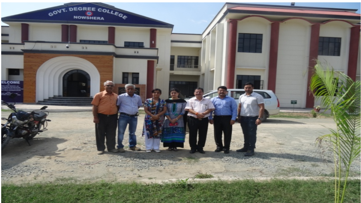
University team during inspection for introduction of science stream in the college.