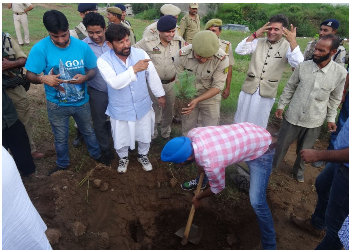
Hon'ble Forest Minister, Ch. Lal Singh Ji during Plantation Drive